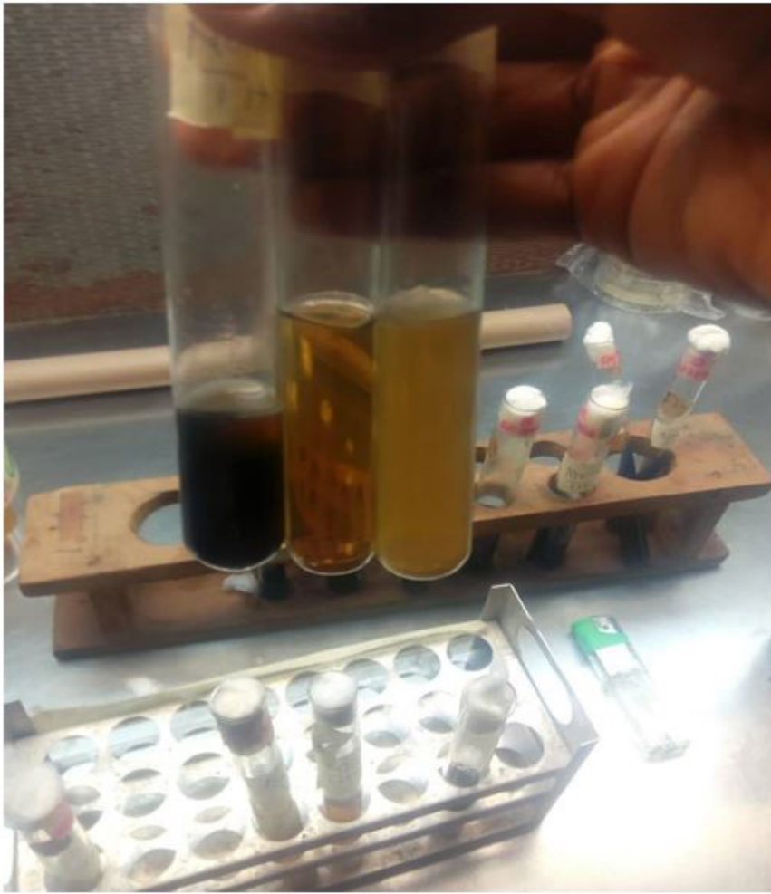
Figure 1: Pure bacteria strain in the nutrient, manitol and Salmonella-Shigella broth