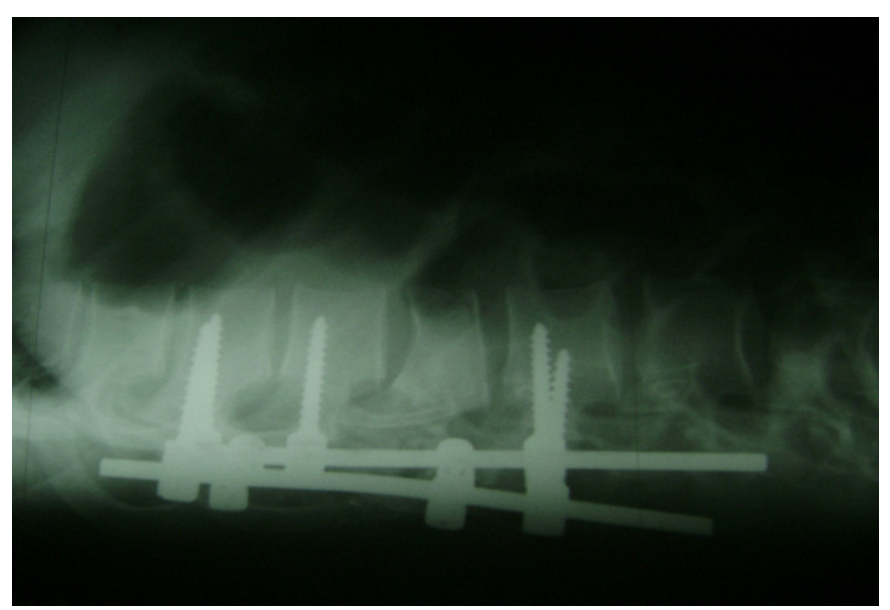
Figure 5: Posterior midline approach intra-operative photograph

The choice between sub-laminar wiring and pedicle screw fixation depended on the availability of implants in the state health sector at the given instance. Both procedures were undertaken with the patient prone and the spine exposed through the posterior midline approach (Figure 5). Spinal decompression was under taken with laminectomy where indicated and posterior instrumentation was undertaken. Cancellous bone graft from the iliac crest was used for a posterior fusion in both sub-laminar wiring as well as following pedicle screw fixation (Figure 3, 4 and 5). In both the groups two levels above and below were fixed. The criteria for fixation were all unstable fractures based on Denis's three column classification, with and without neurology. Anterior instrumentation was not under taken. The mean follow up was 3 years with a range of six months to 4 years.