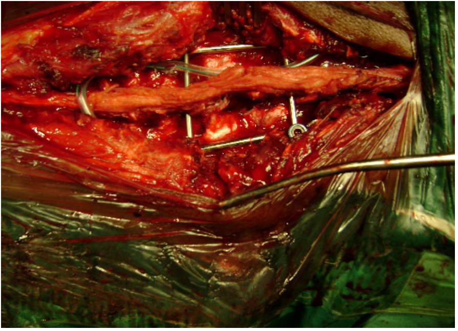
Figure 3: Pedicle screw fixation

In this retrospective case series, cases treated operatively by the authors were looked upon. A total of 37 pedicle screw fixations (Figure 3) and 58 sub laminar wirings (Figure 4) were done during a period of five years from 2004-2009.