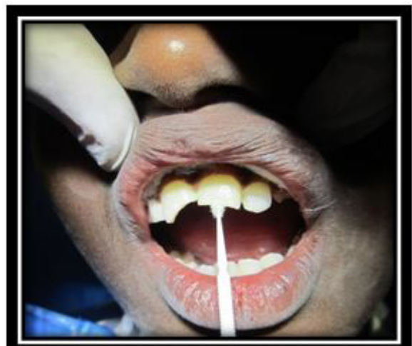
Figure 5: Application of bonding agent