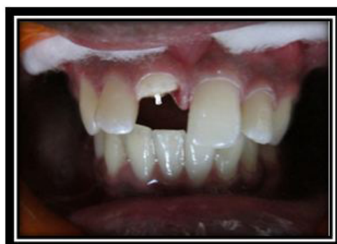
Figure 8: Cemented fiber post

The day after completion of the endodontic treatment, Post space preparation was done with the corresponding drill to receive a prefabricated glass fiber post [Reforpost, Angelus]. The prefabricated post was checked in the canal for adaptation. Self-adhesive dual cure resin cement (Multilink speed; Ivoclar Vivadent AG, Schaan, Liechtenstein) was used for luting fiber post & reattaching coronal fragment. Resin cement was delivered from the automix tip into the post space & on the fiber post. The post was then seated into the canal and the excess cement was removed. Polymerization was done for 40 seconds through the post (Figure 8).