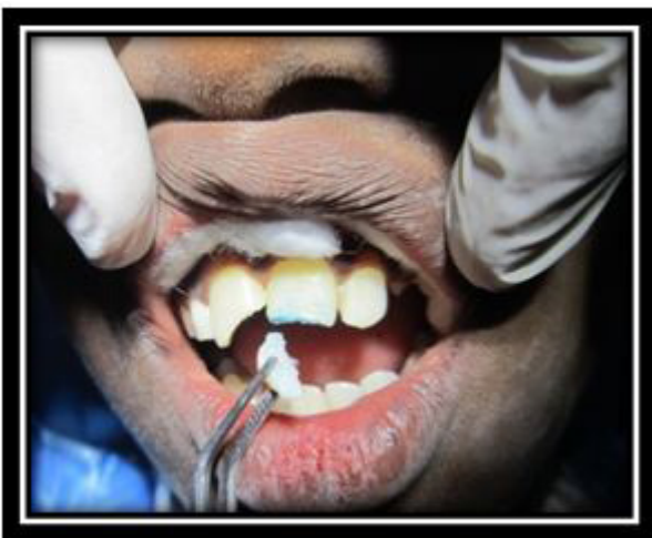
Figure 4: 37% phosphoric acid gel was applied Onto the tooth & the fragment

The operating field was isolated and the fractured surfaces of the tooth & fragments were cleaned with treated with 37% phosphoric acid gel for 30 seconds, followed by rinsing (Figure 4). The adhesive system (Prime and Bond NT, Dentsply) was then applied to the etched surfaces & light cured (Figure 5). Flowable composite (Ivoclar vivadent) was applied to both fragment and tooth surfaces. When the original position had been reestablished, stable finger pressure was applied on the fragment, excess resin was removed and the area was light-cured. Additional composite was placed after the first cure in order to restore any undercountoured areas. Margins were properly finished with diamond burs and polished with a series of Sof-Lex disks (3M ESPE) and diamond polishing paste. The immediate postoperative view shows adequate esthetic results with restored functionality (Figure 6).