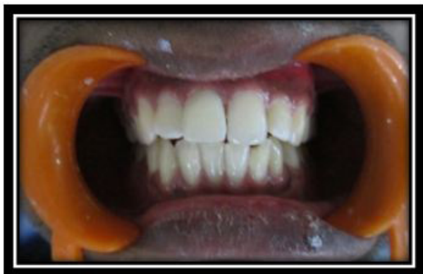
Figure 9: Post-operative view

The fragment was then adapted to the tooth and fit was verified. Resin cement (Multilink speed ; ivoclar Vivadent AG, Schaan, Liechtenstein) was applied to the fractured fragment, the post and the fractured tooth and the fragment was carefully repositioned. Excess cement was carefully removed from the margins and final curing was done for 40 seconds. Margins were properly finished. The immediate postoperative view shows adequate esthetic results with restored functionality (Figures 9 and 10).