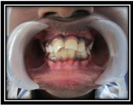
Figure 1: Pre-operative view

(Figure 2). Clinical & radiographic examination revealed uncomplicated tooth fracture (Ellis class II) with no evidence of pulpal exposure, mobility or root fracture of 21 & Ellis class III fracture of 11(Figure 3). The treatment plan of choice was to reattach dental fragment of the 21 and root canal treatment of 11. The fragment was tried in intraorally to check for proper positioning and fit with the fractured coronal structure.