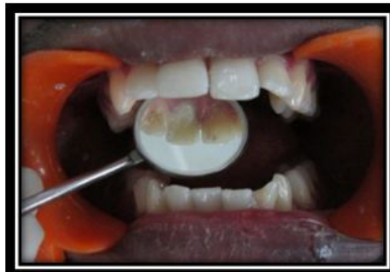
Figure 10: Post-operative palatal view