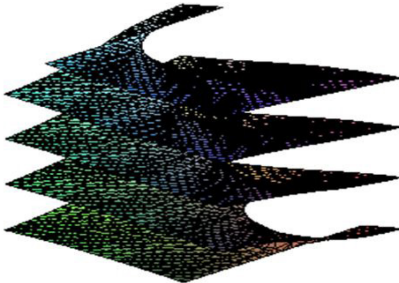
Figure 2: The path followed by the Hamilton Graph