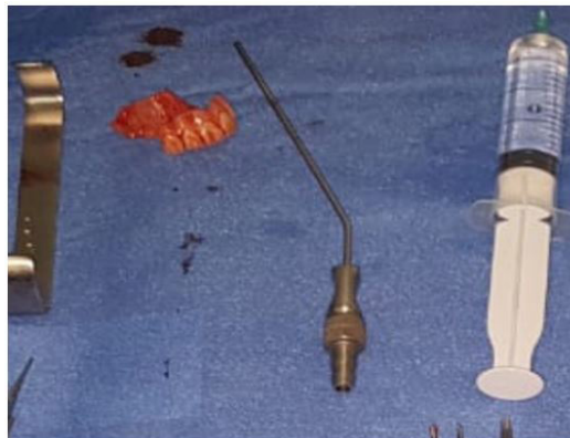
Figure 3: The picture showing the removed denture with a wire on one side