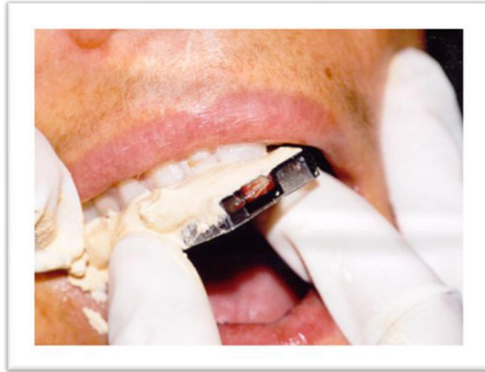
Figure 8: Creamy stone was brushed and poured into the resin record and denture tooth cards to record paths

To obtain the functional core we used a simple artificial teeth support plate (denture tooth cards) as a <<tray like >> which was loaded with creamy fast setting stone (snow white of Kerr). It was positioned on the occlusal surface of the quadrant so that it covered at least one tooth at the both sides of the prepared premolar (Figure 8).