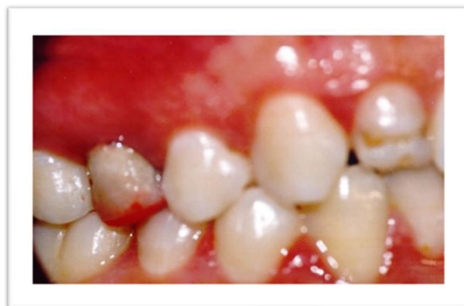
Figure 3: The patient closed in maximum intercuspation position (MIP)

The patient was instructed to close the mouth in the maximum intercuspation position (MIP) and then perform right lateral, left lateral, and protrusive movements in succession, ending in the maximum intercuspation position (Figure 3, 4 and 5).