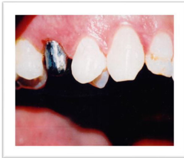
Figure 12: Trying metal framework

These paths registered with a stone matrix will be used by the ceramist as a guide and the framework was casted in a Nickel-chromium alloy following standard laboratory procedures. It was finished and polished, returned to the master cast, and tried intraorally. It always requires a try-in step to confirm fit, insertion retention, marginal integrity, and mostly the space left for cosmetic ceramic (Figure 12) [18,19].