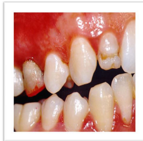
Figure 6: Protrusive paths are recorded last

(Figures 4, 5 and 6): The patient was instructed to perform the eccentric movements