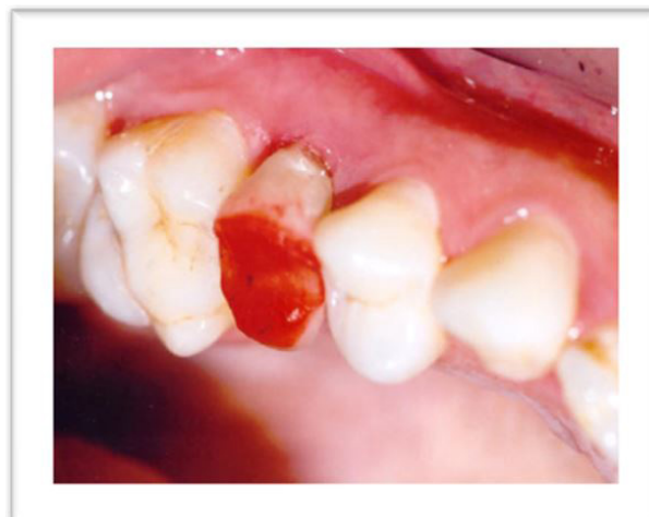
Figure 7: All occlusal contacts are high lightened and checked

The occlusal surface was examined and all eccentric contacts became visible with the wiping away of the resin (Figure 7) [17].