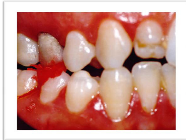
Figure 4: Lateral paths are recorded in working excursion.

The paths of the cusps in working excursion were recorded and the area and direction of this excursive movement were demonstrated by fine lines in the inset. The path of the cusps in the non-working excursion were recorded next (Figure 6). The excess pattern resin was trimmed off using an acrylic trimmer.