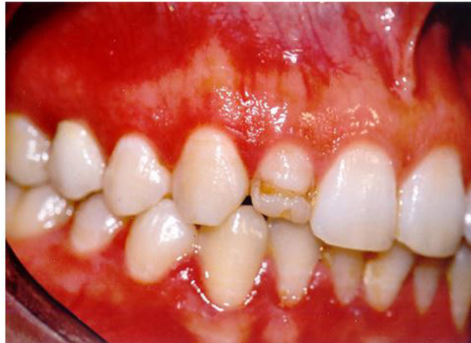
Figure14: Extra-oral View after Cementation

It was observed that there was absolutely no occlusal error identified in the MIP position. Only minimal eccentric interferences were identified and could be eliminated by selective grinding of ceramic. The final prosthesis was cemented using glass ionomer cement (GC Fuji II, GC Corporation, Japan) (Figure 14) [17].