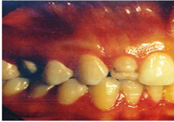
Figure 1: Prepared tooth 2 nd PM restored with core and post

A temporary acryl restoration has been carried on. After checking the occlusion contact, this provisional crown was reduced almost 1mm in its occlusal surface.