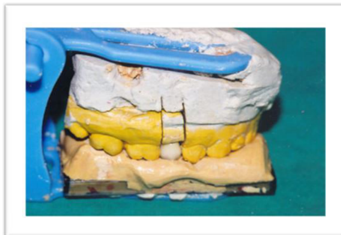
Figure 13: Ceramic stratification fitted to the die

After shade selection the stratification of ceramics was performed with accurate checking of the occlusal morphology using the functional core (Figure 13).