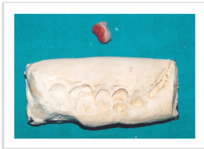
Figure 9: Functional core with temporary crown

The functional core is the stone replica of the movement of the cusps tips was removed and carefully checked and carefully checked (Figure 9).