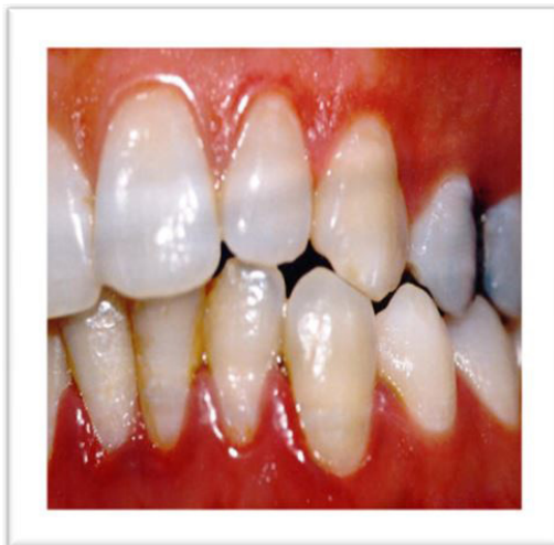
Figure 5: Lateral paths are recorded in nonworking excursion