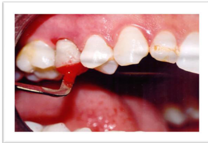
Figure 2: A layer of resin (Duralay) applied on occlusal surface

The occlusal morphology was generated using pattern resin (GC Corporation, Tokyo, Japan) following the technique described by Dawson [15]. Pattern resin was mixed according to the manufacturer's instructions and applied on the occlusal surface (Figure 2).