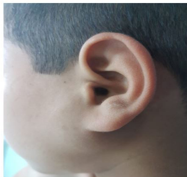
Figure 1: Photograph showing a Mass of the Left Parotid

A 10-year-old boy with no medical, surgical or remarkable family histories, presented with a slow- growing, painless mass of three years evolution in the left parotidic region. Physical examination revealed a well-defined, approximately 3 cm/ 2 cm sized, smooth, mobile mass (Figure 1). Facial and other cranial nerve examinations revealed no abnormalities. Parotid ultrasound showed a 2.88/2.34 cm mass with a hypoechoic pattern, well-defined margins, and homogenous echogenicity with acoustic enhancement originating from the superficial parotid lobe (Figure 2). CT scan showed a well-defined mass of the left parotid, lobulated, homogenous, with mild enhancement in the center and multiple small lymph nodes (Figure 3). Results of the routine blood investigations were normal. Total conservative parotidectomy was done. Modified Blair incision was made, skin flaps were raised and well encapsulated mass was visible. The trunk and main branches of the facial nerve were preserved. The mass was dissected and removed without difficulty, and was classified as type A, according to Marchioni et al. , (Figure 4).