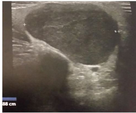
Figure 2: Sonographic scan showed a mass with a hypoechoic pattern, well-defined margins, homogenous echogenicity and acoustic enhancement