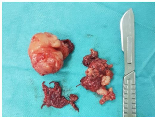
Figure 4: Photograph showing the Resected Tumor

Histopathological examination confirmed the diagnosis of a benign schwannoma. Microscopically, the tumor consisted of palisading spindle cells with immunohistochemical expression of the S-100 (Figure 5). Facial nerve functions were normal after the operation and no recurrence was encountered within a ten month follow-up.