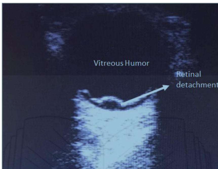
Figure 1: Retinal detachment