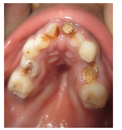
Figure 3: Maxillary Arch Showing Palatal Swelling With V Shape Arch