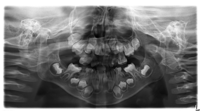
Figure 5: Orthopantomogram