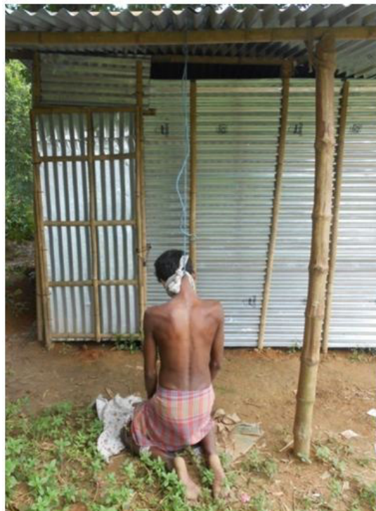
Figure 2: Victim hanged on kneeling with a nylon rope from a bamboo beam. The total length of the rope is 220 cm and the length between the suspension point and the ligature knot around the neck is 100 cm, the rest part of the rope being freely suspended from the suspension point

The unusual methods adopted by the victim are shown in Figure 2-6.