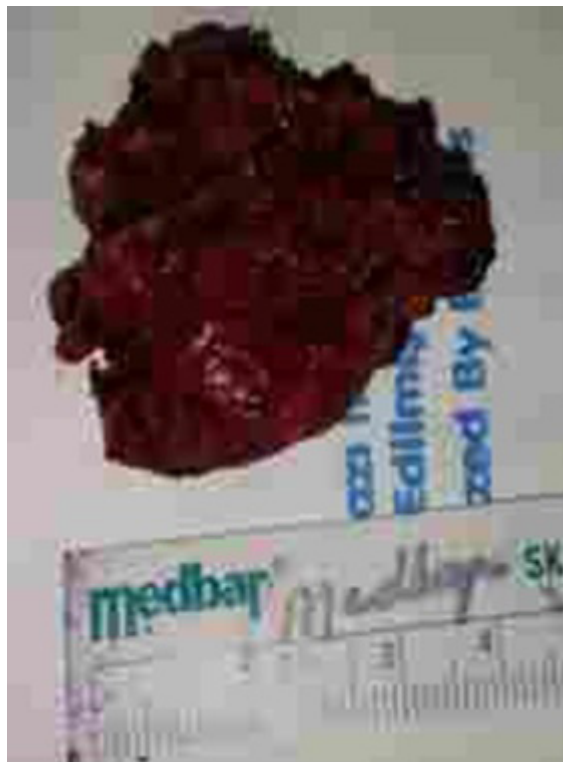
Figure 2: Macroscopic view of the specimen

Fine needle aspiration biopsy (FNAB) revealed insufficient diagnosis. After Informed consent was obtained from patient, we considered parotidectomy. During the surgical procedure we found the facial nerve at first. Then we followed the trace of the facial nerve and detected the tumor was located on the deep lobe of the gland. We excised the lesion with intact surgical margin (Figure 2). At frozen section examination there was no invasion. Finally we surgically sutured and fixed the parotid gland. Pathologic examination define the tumor as BCA of the parotid gland (Figure 3a,b). The patient has a mild transient weakness during eye closing for one month period. Throughout the 1 year follow up, there was no complaint and recurrence detected.