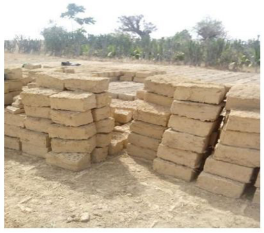
Figure 1: Picture showing adobe blocks