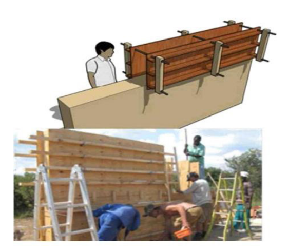
Figure 2: Showing ways of coupling framework for rammed earth structure

or mechanically (motorized). These bricks are moulded in different forms e.g. solid blocks, hollow blocks, interlocking blocks, perforated blocks, etc.