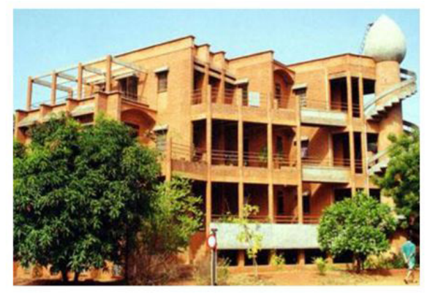
Figure 4: Vikas Community on 4 floors

Cynics may question the need to reintroduce what they believe to be an inferior building material best left in the past. Earth when used in buildings is recognized as having a number of remarkable characteristic features for the realization of sustainable development. The use of earth has grown rapidly in the developing nations. In countries with no industrialized means, earth remains the main, if not the essential building material for necessary access to development. Earth in modern architecture represents a considerable improvement over traditional earth building technique [9].