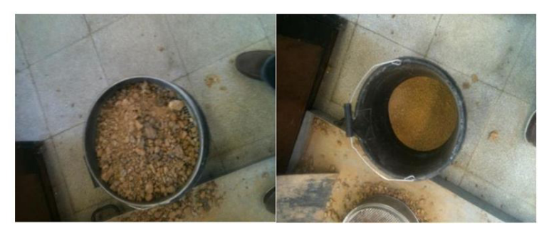
Figure 3: Crushed soil placed into sieve and soil after it has been sieved

First of all, it is necessary to find the right (workable) kind of soil. Sandy, but not all sand (between 50% and 75% is ok) with a mixture of clay as a binding agent [1,2]. You mustn't have too much clay either, or the finished wall will shrink and crack. The first construction step should be the sieving of the soil through a slanted screen of 1" mesh hardware cloth to separate out any big stones, roots, etc. Spread a tarpaulin over the screened dirt to protect it from precipitation (if the soil contains more than 10% moisture it will puddle, not compress) [2]. When you make a ball of earth in your hand it should hold its shape but break and scatter when dropped (Figure 3).