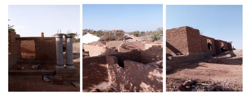
Figure 8: Picture showing columns finished with built cement paste, building at window level, foundation wall with sandcrete blocks and framework of lintel

Table 3: Building Information of case study 3