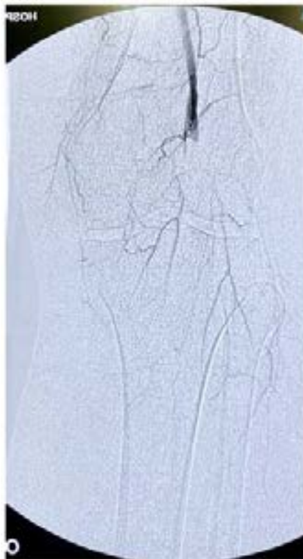
Figure 10: Preoperative angiography showing popliteal and infrapopliteal arteries occlusion

A female patient, 49 years, diabetic, was admitted at the hospital with COVID-19 infection, confirmed with RT-PCR test. The patient was hospitalized and was submitted to clinical treatment with intravenous dexamethasone and enoxaparin 40mg / day. At the 10th day of infection, the patient presented a sudden pain at left lower limb associated with a cyanotic hallux. Initially, the attending physician believed to be a worsening onset of the respiratory tract and initiated clinical treatment with enoxaparin 80mg subcutaneous 12/12 hours. At the 13th day of COVID-19 infection, the patient experienced a worsening of the leg symptoms and a vascular surgery was called to evaluate the patient. At the physical examination the patient had only femoral pulse palpable