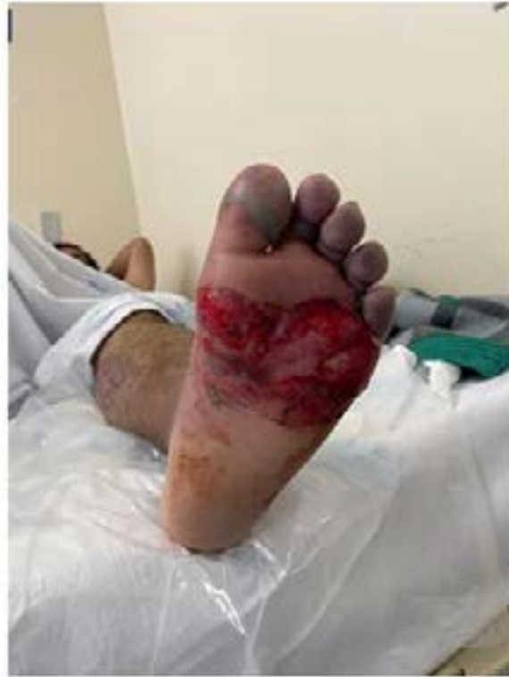
Figure 3: Borderline cyanosis among the toes and the foot in CASE 1