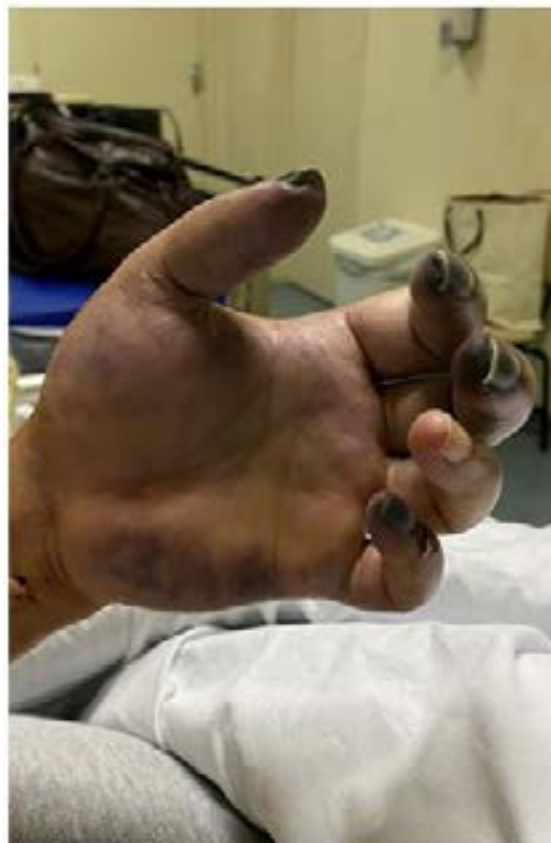
Figure 6: Irreversible Hand Ischemia