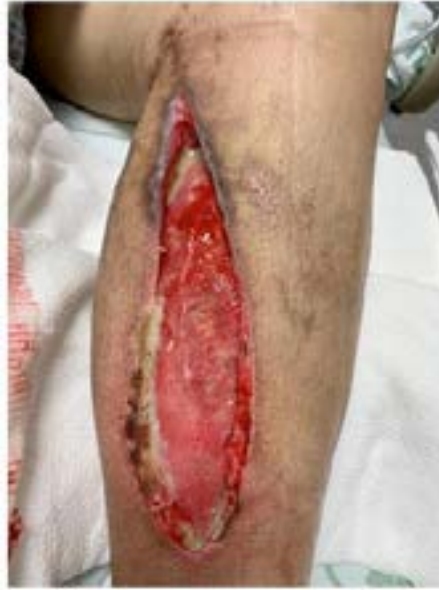
Figure 9: infected fasciotomy which led to Meropenem and Vancomycin use

After the surgery, the patient presented with a septic shock, pulmonary and fasciotomy infection, major organic failure, renal impairment and orotracheal intubation, which led to the necessity of trasference to the intesive care unit, hemodynamic instability and death on the 10th post-operative day.