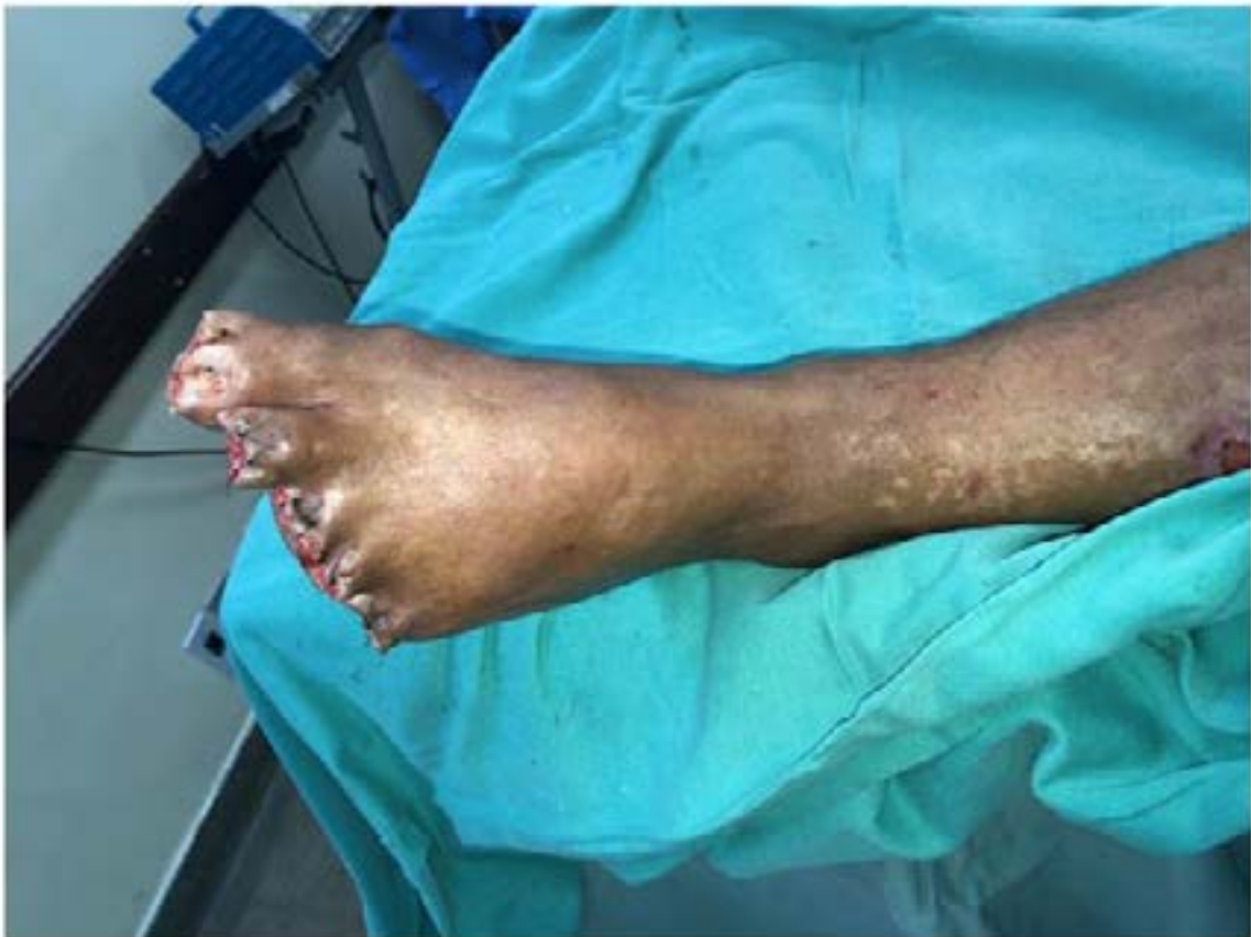
Figure 4: Final aspect of the foot in CASE 1