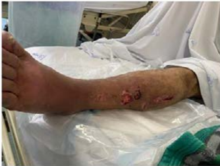
Figure 1: Fasciotomy infection in CASE