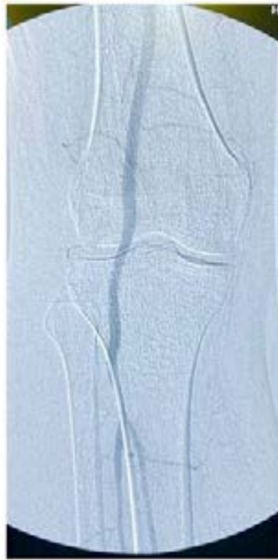
Figure 11: Post-operative angiography showing satisfactory blood flow restoration

in the left lower limb with femoral, popliteal and pedal pulses palpable in the right lower limb and a Rutherford IIb acute limb ischemia. D-dimer dosage was 10.859mg/dl and creatinophosphokynase was 5670mg/dl. Under general anesthesia and intravenous non-fractionated-heparin 80 UI/Kg infusion the patient was then submitted to an angiography (figure 10) and a successfully thromboembolectomy of the popliteal and infrapopliteal arteries through infrapopliteal artery dissection and Fogarty 4 and 3 use. A post-operative angiography (Figure 11) showed satisfactory evolution and the patient evolved with popliteal and pedal pulses palpable. The patient was hospital discharged four days after the surgery and had adequate oral anticoagulation with Rivaroxaban 20mg daily with successfully revascularization and limb salvage.