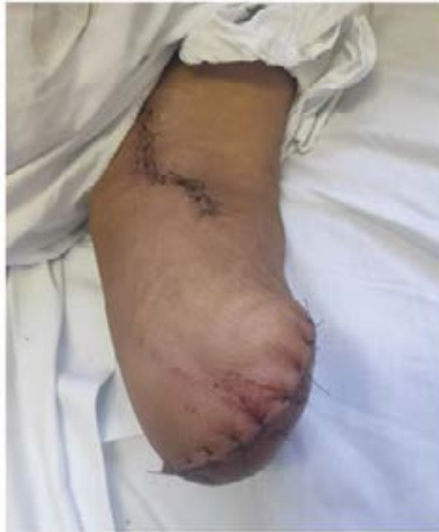
Figure 7: Final aspect of the hand amputation