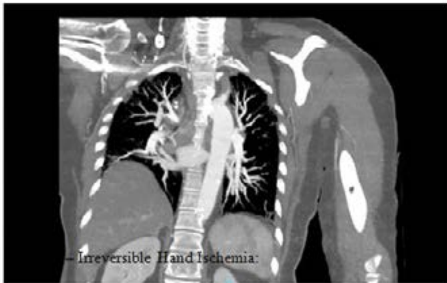
Figure 5: Angio-CT SCAN with subclavian artery occlusion in CASE 2

34.6g/dl, creatinine 1,6 mg/dl, Urea 44mg/dl, D-Dimer 19450 mg/dl and leukocytes 15.8 \times 10^8 cells/. Despite the Rutherford III condition and in order to ensure upper limb extremity amputation level, she was submitted to an arterial exploration through direct open brachial artery exposure and thromboembolectomy under general anesthesia and partial restored blood flow, with brachial pulse and without radial and ulnar pulses. At the 1 st post-operative, the ischemia has progressed and the brachial pulse was absent. The patient was submitted to an angioCT-Scan that showed occlusion at subclavian artery origin. (Figure 5), which led her to a second arterial exploration with brachial access, axillar, brachial, radial and ulnar thromboembolectomy, followed by an origin subclavian ballon-expandable stent implantation 8x39, and axillar artery self-expandable stent 7x60 implantation due to an artery dissection, through right femoral approach. The patient evolved with brachial and radial pulses, without ulnar pulse, and was treated with Clopidogrel and enoxaparin 1mg/kg/12/12 hours. Despite the technical success, the left hand presented with irreversible ischemia (Figure 6), and an increasing at creatinephosphokynase levels (1841 mg/dl), which led to a hand amputation at the 8 th day post-operative (Figure 7). The patient was discharged at the 4 th day post-operative hand amputation, with AAS and clopidogrel prescription.