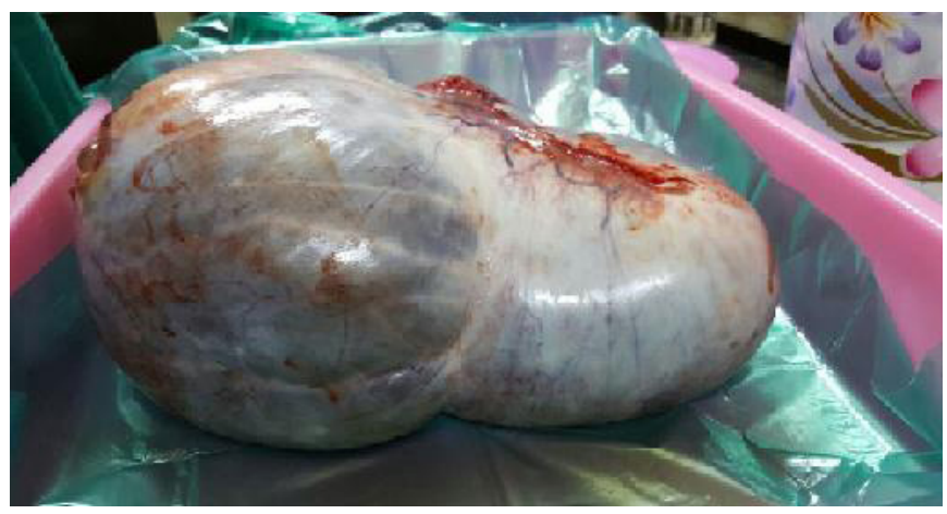
Figure 4: A huge ovarian mass of 7.5 kgs