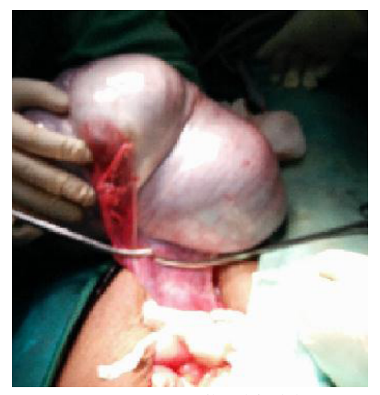
Figure 2: Intra-operative picture of large left sided ovarian mass.